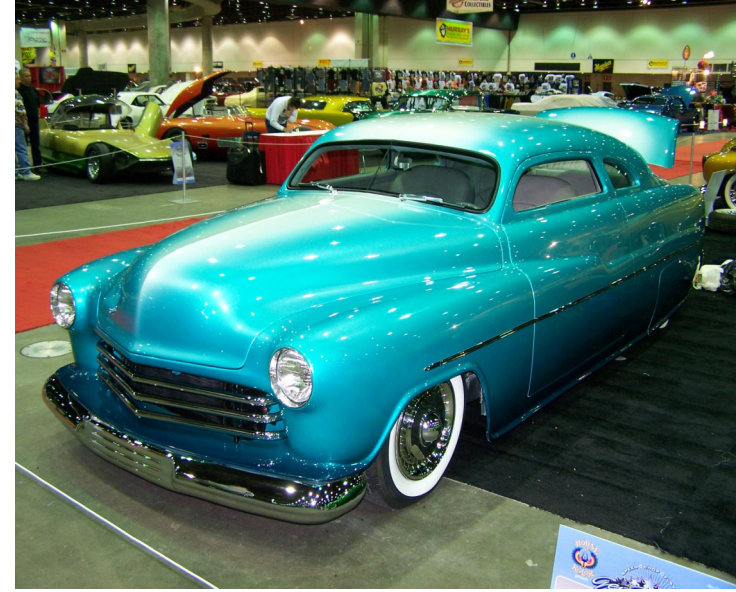
One Among Many...Ourstanding “Rides” at Autorama 2008