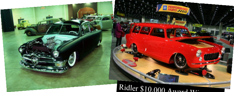
Ridler $10,000 Award Winner